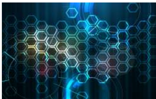
Figure 1: Insert caption to place caption below figure (Century Gothic 10)