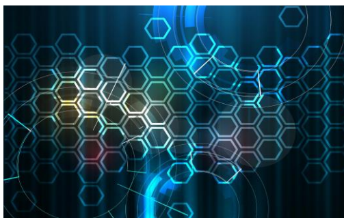
Figure 1: Insert caption to place caption below figure (Century Gothic 10)